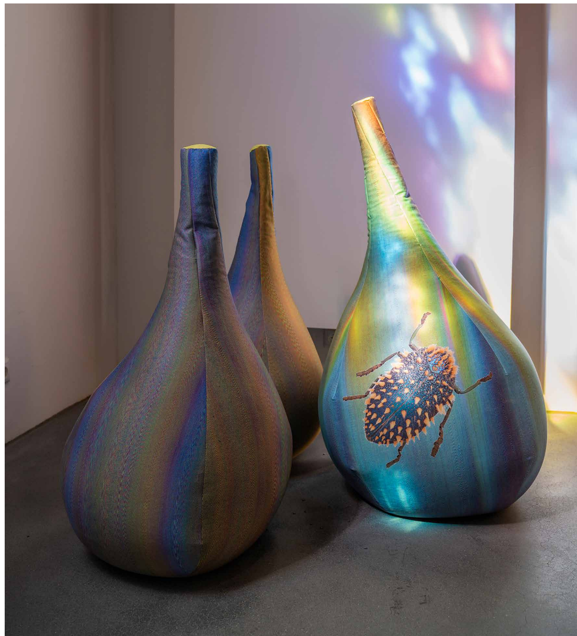
Untitled (Escherichia coli) €2500 2022 Fabric, thread, EPS pearls 45 x 220 x 30 cm Unique